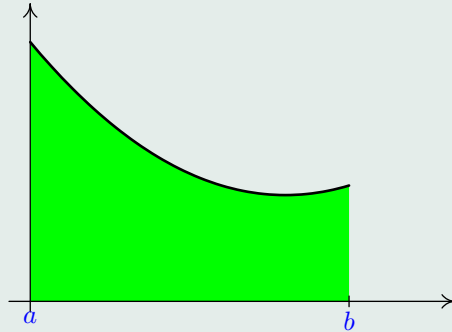
Figure 1: Floating figure